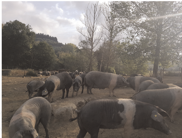
Figure 2. Cinta Senese sow with piglets.