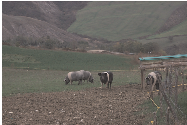
Figure 3. Cinta Senese boar.